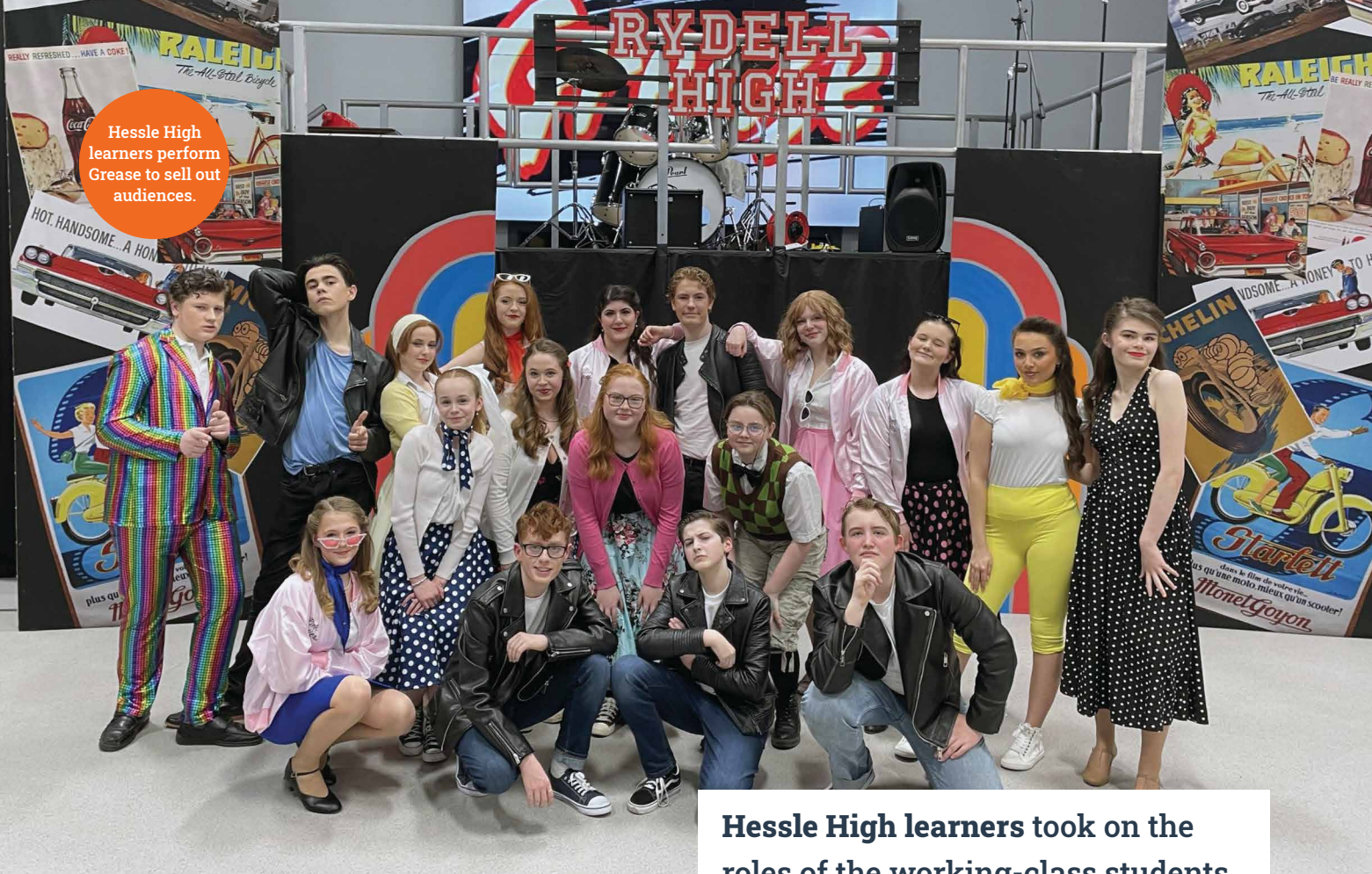
Hessle High learners perform Grease to sell out audiences.

Hessle High learners took on the roles of the working-class students of Rydell High, navigating their way through the complexities of peer pressure, politics, personal core values and love in a school production of Grease.