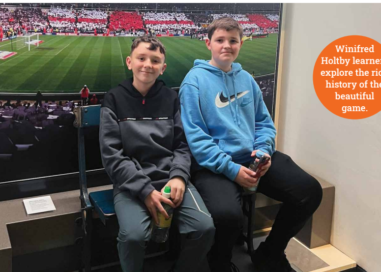
Winifred Holtby learners explore the rich history of the beautiful game.

Winifred Holtby Academy's latest sports tour was an experience to remember, as learners and staff embarked on an exciting trip to Manchester for a day packed with football history, interactive challenges, and live-action drama.