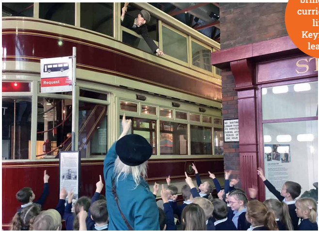
Visits bringing the curriculum to life for Keyingham learners.

Foundation learners were excited by the Fire Brigade's visit to the school. Year 1 learners travelled to the Streetlife Museum where they took part in a transport workshop. The Year 5 visit to the Yorvik Museum gave the learners the chance to explore the DIG museum and take part in the Roman town workshop . These opportunities bring the curriculum to life and lead to interesting conversations when back in the classroom, where the learners can delve deeper into the topics, armed with the insights these trips provide them.