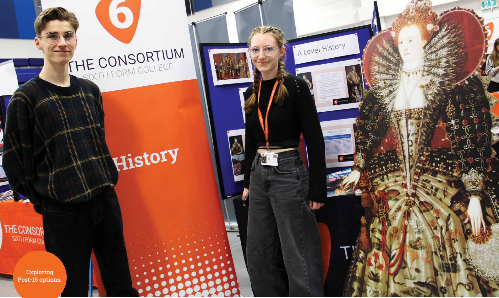
Exploring Post-16 options.