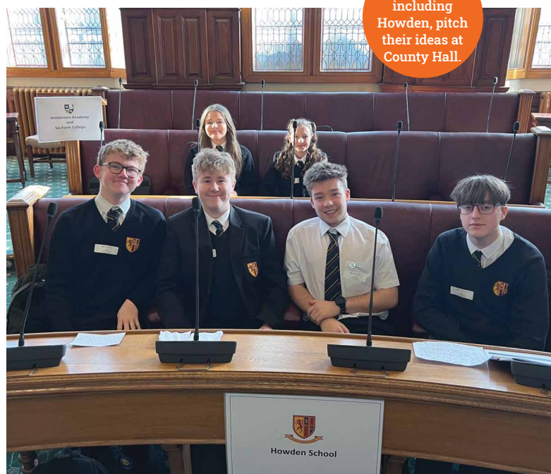
Trust schools, including Howden, pitch their ideas at County Hall.

currently studying in the Sixth Form and allowed them to get first-hand knowledge of what is on offer. Each subject had a stall manned by a current Year 12, allowing Year 10s to ask any questions about the particular subjects they are interested in, including what topics are covered in the course, how they are assessed and what they like about the subject. This was also a great opportunity to look around the facilities at each campus and experience a flavour of life at The Consortium Sixth Form College.